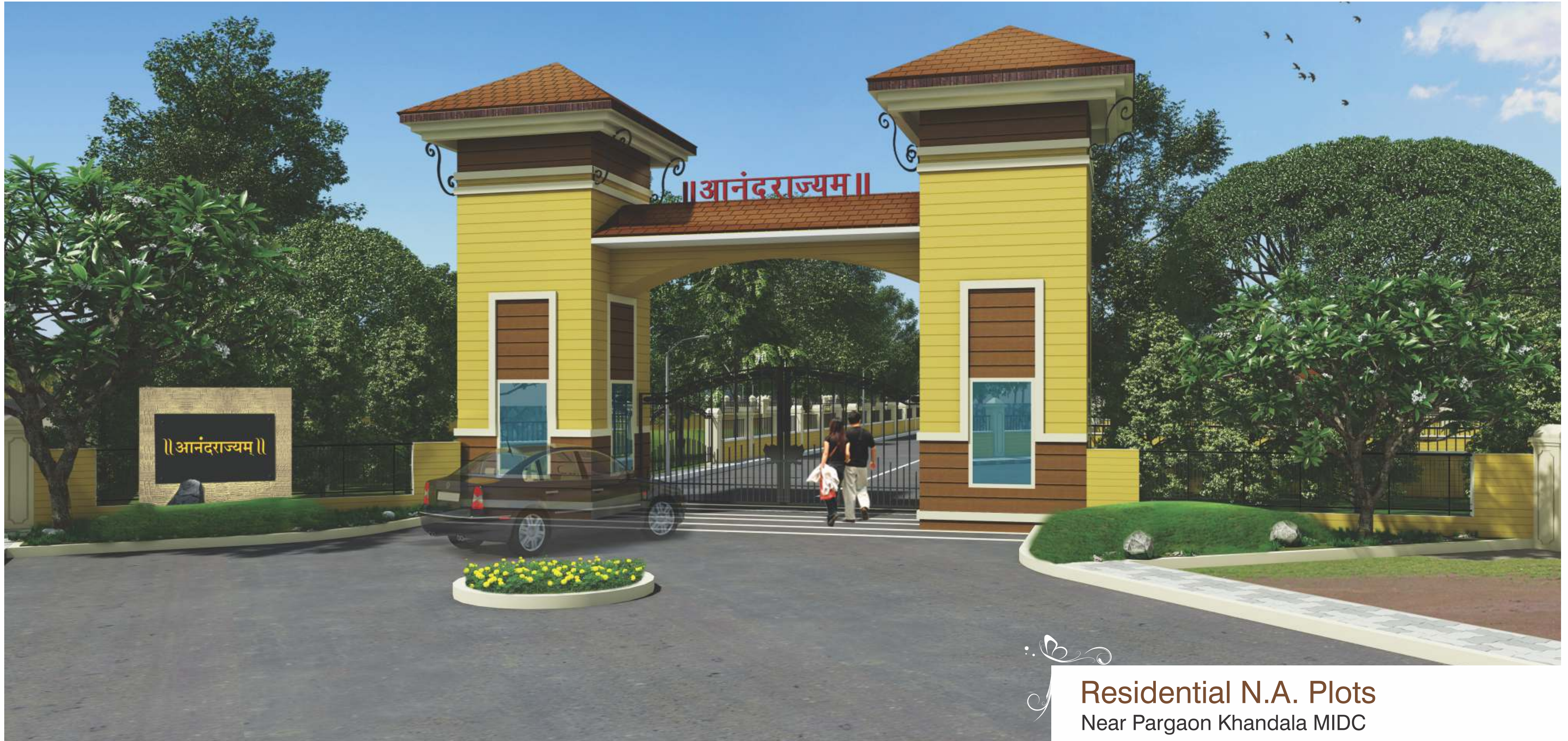
Residential N.A. Plots Near Pargaon Khandala MIDC